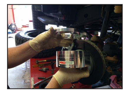
STEP 10: Install spacers over front bump stop, largest spacer at bottom, and secure to the coil spring pocket with included bolt & nut hardware.