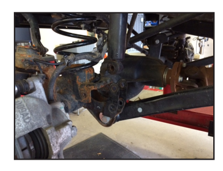
STEP 8: CAREFULLY lower front axle, then remove OE coil spring, and OE upper rubber insulator. RETAIN OE INSULATOR FOR REINSTALLATION IN STEP 11.