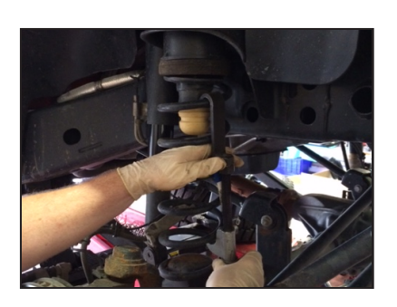
STEP 14: Install lower shock extenders. As shown, you have two height options, depending on the amount of front lift chosen in Step 9. Torque hardware to OE specifications in your chosen orientation.